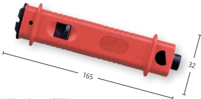
Wire stripper - AE6200