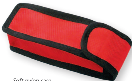
Soft nylon case