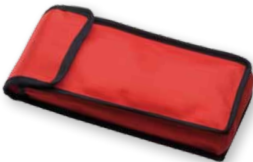
AMS MAXI-Set – AV6240